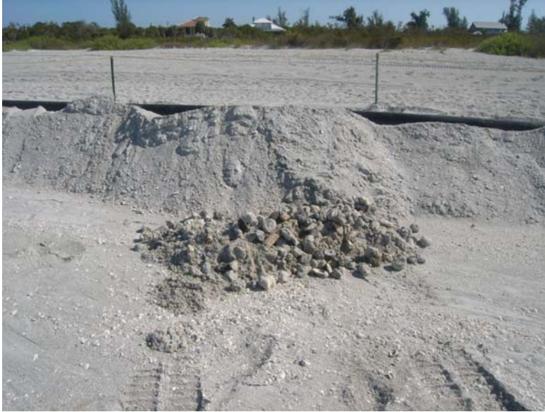
Tuesday, March 10, 2009 Cemented shell, asphalt and concrete pieces dredged from the Gulf side of Blind Pass