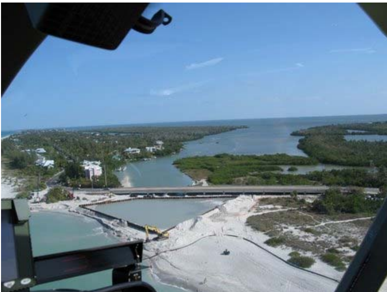
Wednesday, March 24, 2009 View of Containment Cell being filled. (Provide by SCCF & LCMCD)