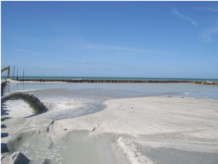
Wednesday, March 25, 2009 View of Containment Cell being filled.